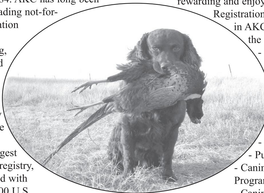
"Just-In, out of HRCH King's Curlee Gurlee x HR UH Sydney of Woodbine, is the author's number one hunter, UKC Total Dog (Conformation & Performance titles on the same day), 2003 UKC TOP TEN Total Dog, and Grand Champion Show dog".