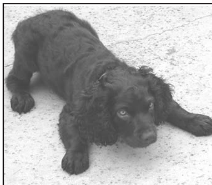
Hollow Creek's Jackson - CA