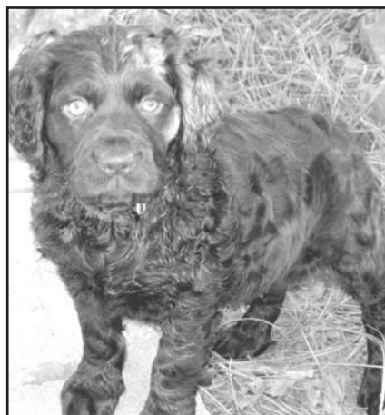
Hollow Creek's Kookie - SC