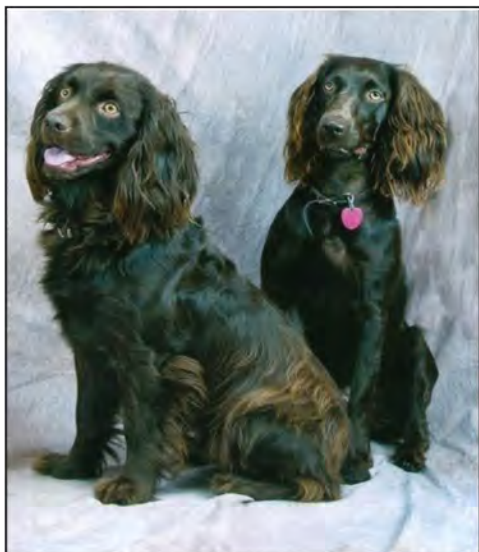
Carolina Magic's "Bud" & Matalin Marie "Mattie"