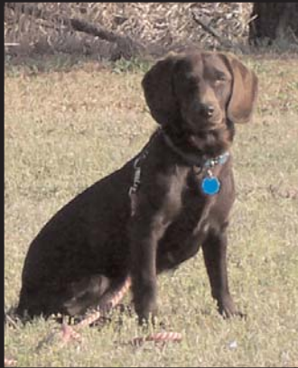
"Cedarway Catfish Creek Abby"